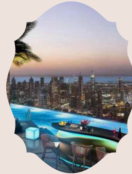
DUBAI UAE 2021