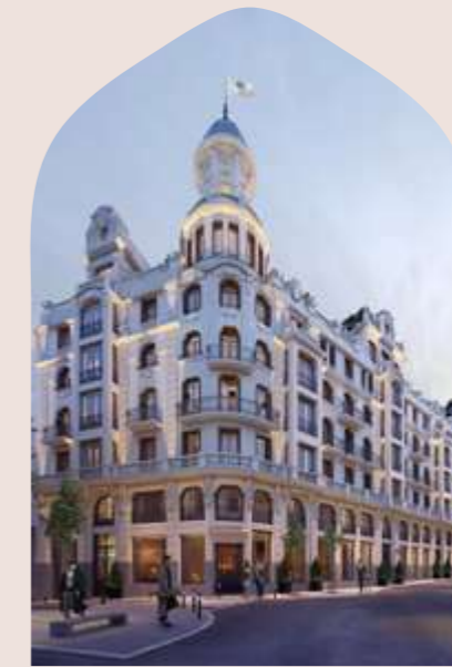
MADRID ESPAÑA COMING SOON