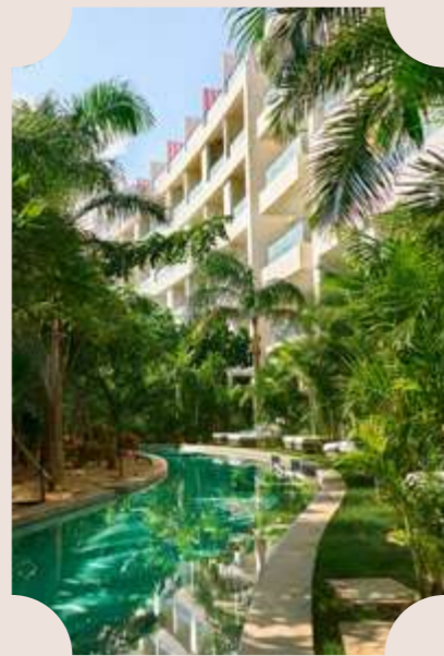
PLAYA MUJERES MÉXICO 2024