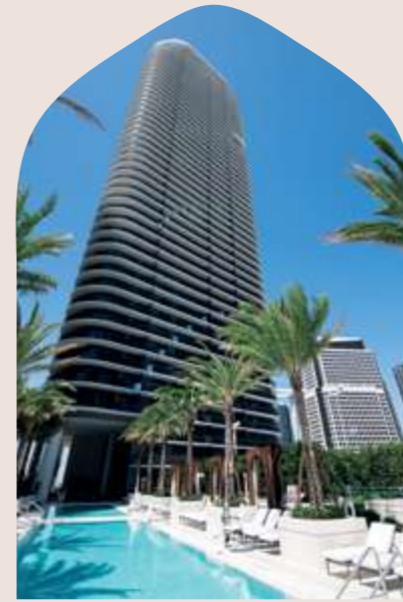
LUX BRICKELL MIAMI 2018