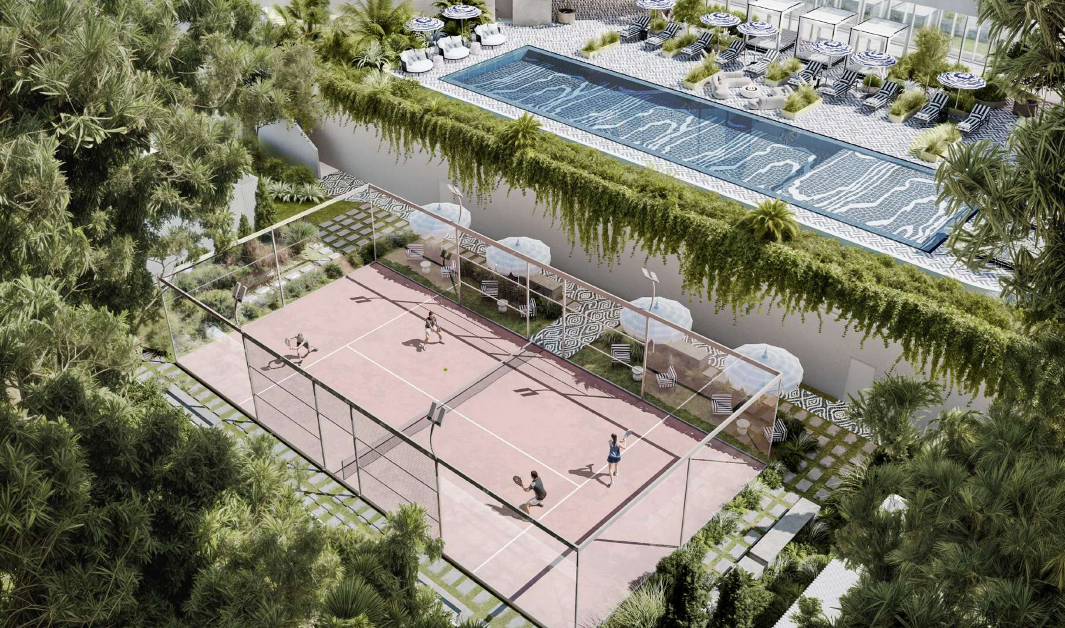
PADEL COURT & SOCIAL DECK

A court seamlessly integrated into the landscape and surrounded by open-air lounges — designed for playing, unwinding, and connecting in a vibrant natural setting.