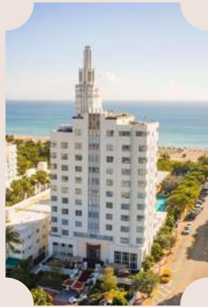
SOUTH BEACH MIAMI 2012