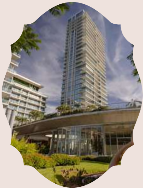
PUERTO MADERO ARGENTINA 2022