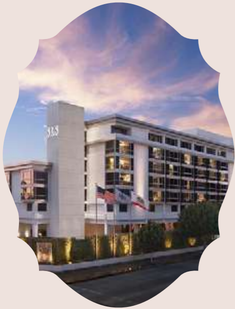
BEVERLY HILLS LOS ANGELES 2008