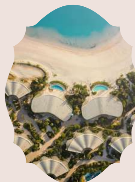
THE RED SEA ARABIA SAUDITA 2025