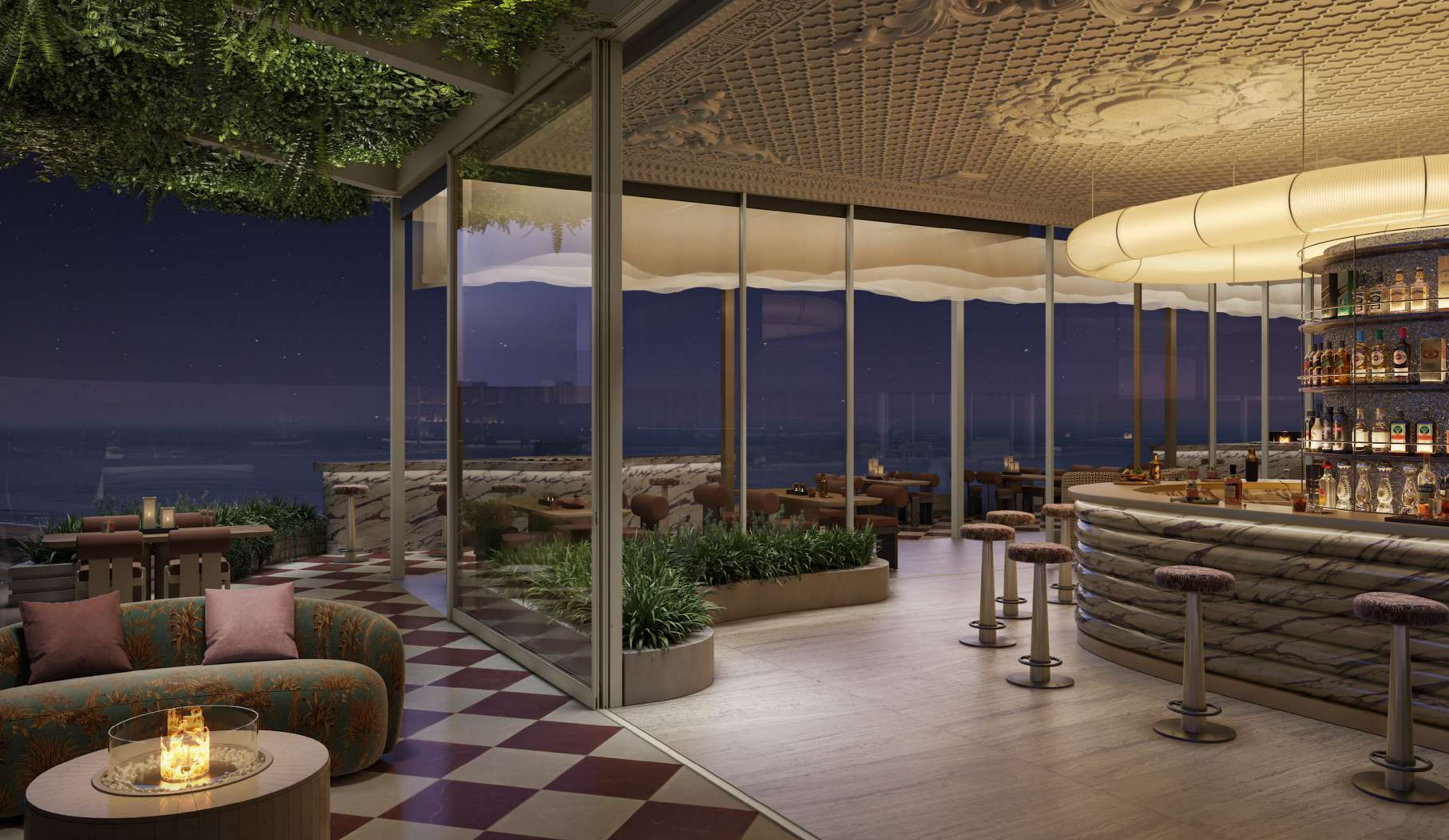
ROOFTOP BAR 24th FLOOR

An elevated seaside experience. A modern, exclusive setting to enjoy signature cocktails and unforgettable sunsets.