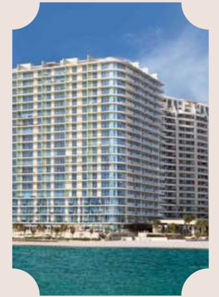
CANCÚN MÉXICO 2021