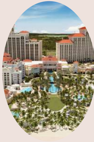
BAHA MAR NASSAU 2017