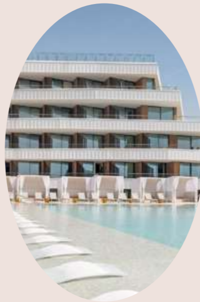
BARCELONA ESPAÑA 2025